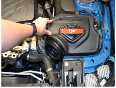
Line up the studs on the air box to the factory grommets and press down on the box.