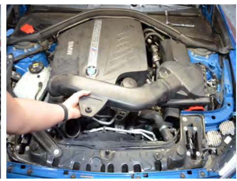
6. Remove the OEM intake assembly.