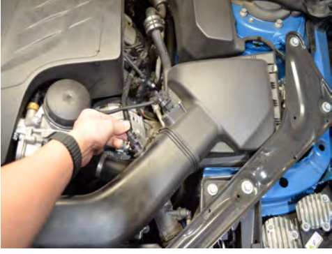
2. Disconnect the MAF harness. IF EQUIPPED: Disconnect the crank case line.