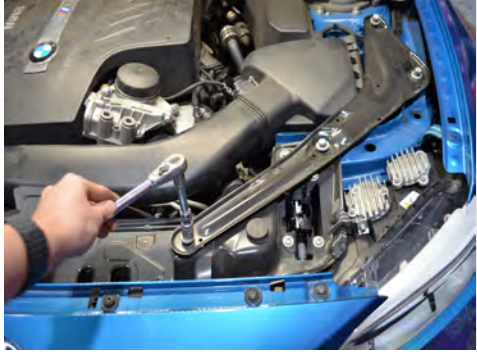
4. IF EQUIPPED: Remove the four bolts holding the strut tower brace.