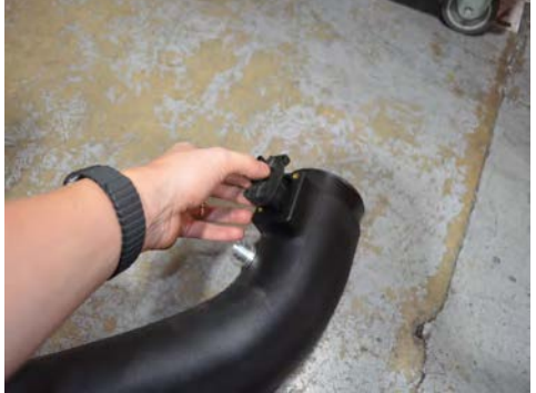
8. Install the MAF sensor into the Injen tube and secure using the provided M4 x 0.7 button head screws.