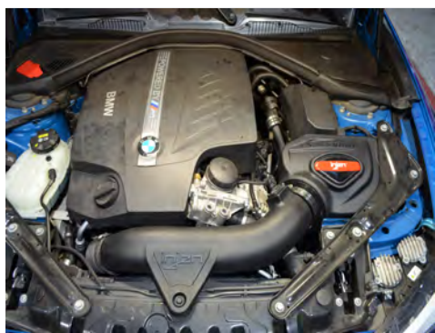
19. Ensure all bolts and clamps are secured properly.

16. Secure the clamp on the turbo inlet pipe.