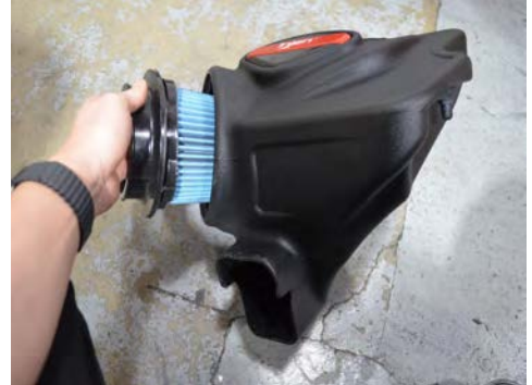
11. Install the twist lock filter on to the Injen air 12. Install the Injen air box into the engine bay. box. Once seated, rotate the filter a 1/4 turn in either direction so the filter can lock into place.