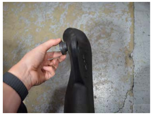
10. Install the grommet into the Injen tube.