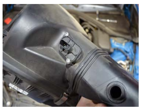
7. Remove the two screws holding the MAF sensor and then remove the MAF sensor.