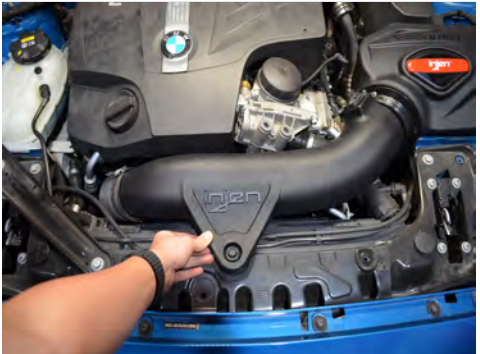
13. Press the injen tube into the turbo inlet pipe. Next 14. Connect the MAF harness. press the tube into the twist lock filter. Finally line up the IF EQUIPPED : Connect the crank case line.