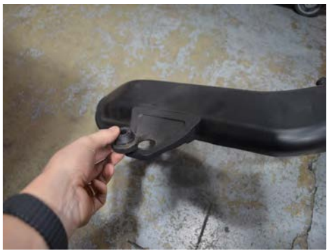
9. Remove the grommet from the OEM tube.