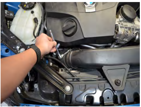
3. Loosen the clamp holding the OEM tube.