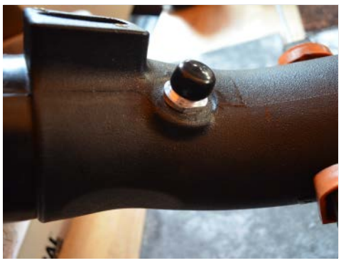
15. If not equipped with crank case line. Cap the crank case fitting with the 3/4" vinyl cap