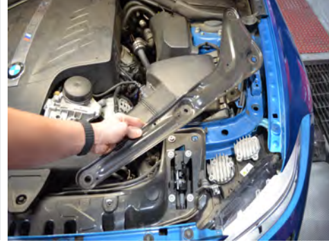
5. IF EQUIPPED: Remove the strut tower brace.