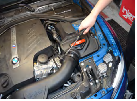
17. Secure the clamp on the twist lock filter.