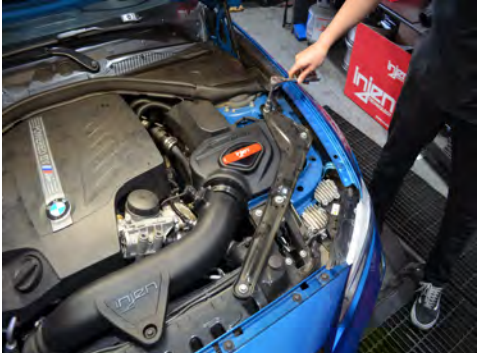
18. IF EQUIPPED : Reinstall the strut tower brace.

Congratulations! You have just completed the installation of this intake system. Periodically, check the alignment of the intake, normal wear and tear can cause nuts and bolts to come loose. Note: Check clearance and adjust if needed! Failure to check the alignment and adjust the intake can cause damage that will void the warranty. Injen Technology is not responsible for any damages caused by/from improper installation.